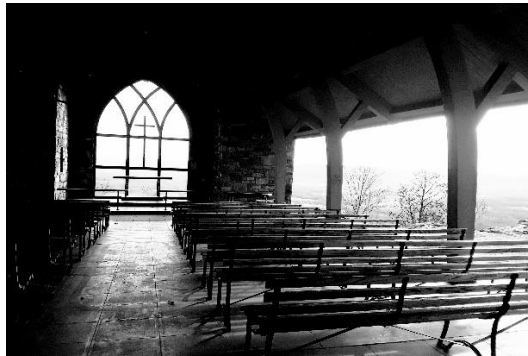
Chapel at Camp Mitchell

Flexibility and adaptability are much in evidence on Sunday February 23 as well, as the Moon moves into fluidic Pisces to conjoin with the Sun there for New Moon moment, which takes place at 9:32 am CST. We get a new vision of life and see ways to grow and change. Venus in Aries squares Jupiter in Capricorn, highlighting the role of the individual in contrast to that of authority and amplifying the theme of mercy, tolerance, and forbearance. The Venus-Jupiter square also hints at overdoing in the indulgence department, however, so we ought to hold on to our self-discipline when too much tempts. The Moon conjuncts retrograde Mercury in Pisces, dissolving old problems from the past through prayer, forgiveness, letting go, perspective, and non-possessiveness. We set aside the petty and open ourselves instead to do the Higher Will.