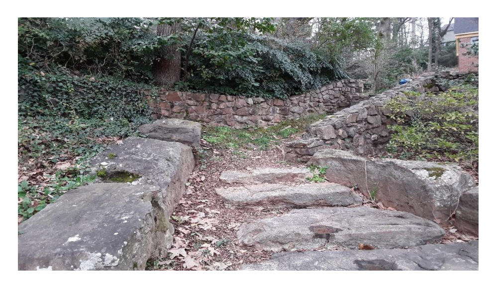
The Opportunity of Decision