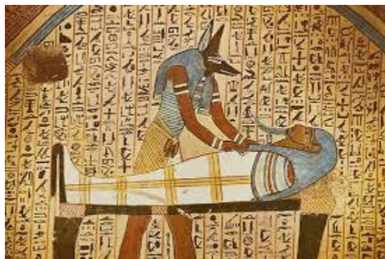
Anubis Tending a Mummy