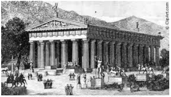
Olympia: Temple of Zeus (undated drawing)

See how closely the architecture resembles this artist's recreation of the ancient Temple of Zeus pictured below.