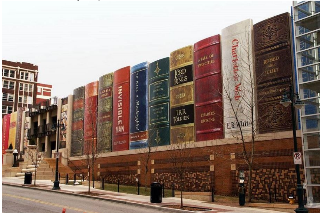
A novel architecture for the library of Kansas City, which offers a facade shaped ledgers stored.