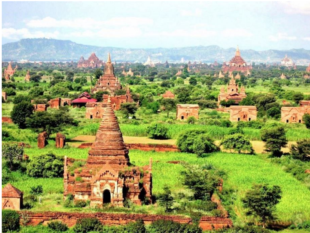
Bagan is a large Buddhist archaeological site of nearly 50 square kilometers in the Region of Mandalay in the central plain of Burma.