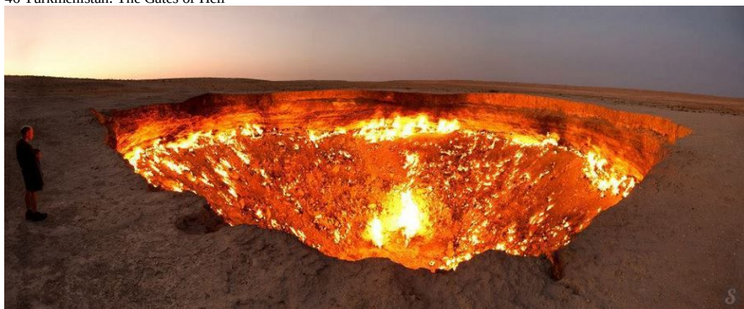
The gate of hell (Door to Hell) is a hotbed of natural gas burning continuously since it was lit by Soviet scientists in 1971.