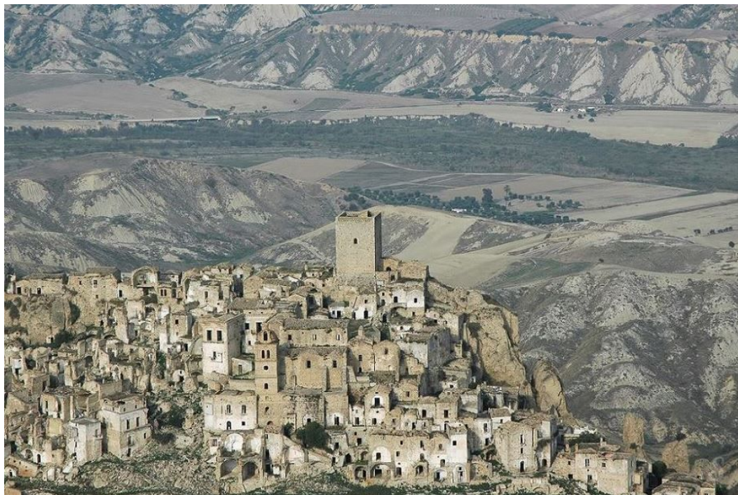
Craco is an Italian town abandoned it a famous tourist destination and a place for film shooting.