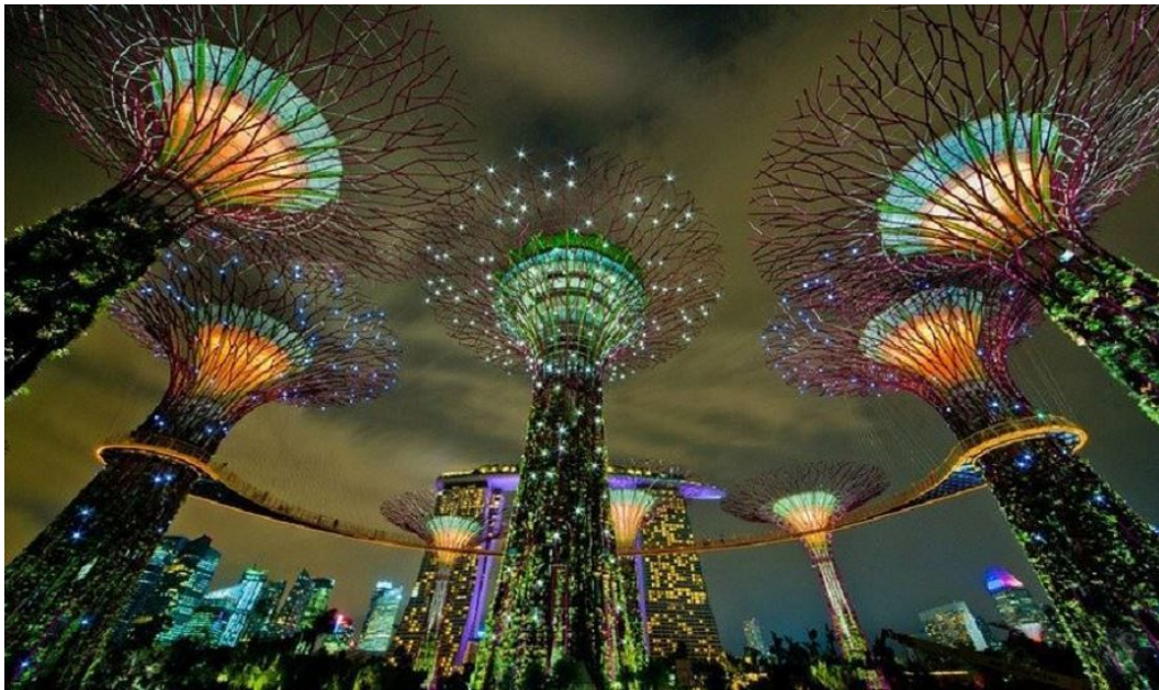
Green space with remarkable biodiversity, built for more than 625 million. This giant park measures 101 hectares and includes three gardens.