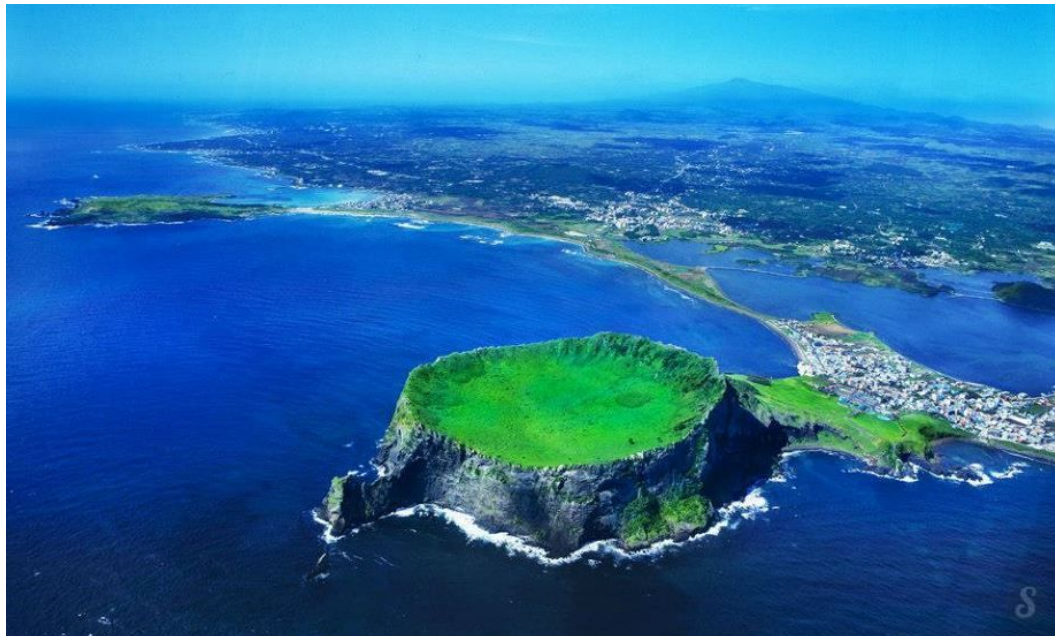
Jeju-do is a province and a sub-tropical island of South Korea oval.