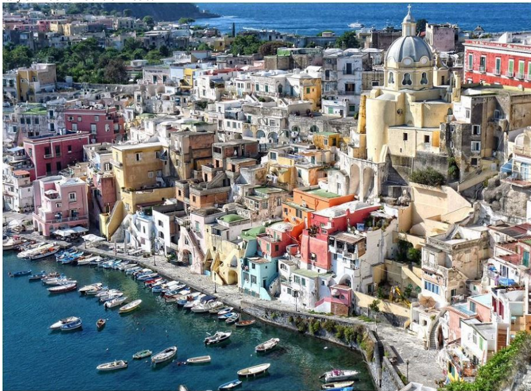
Procida is an island and Italian town of about 10,000 inhabitants, located in the province of Naples.