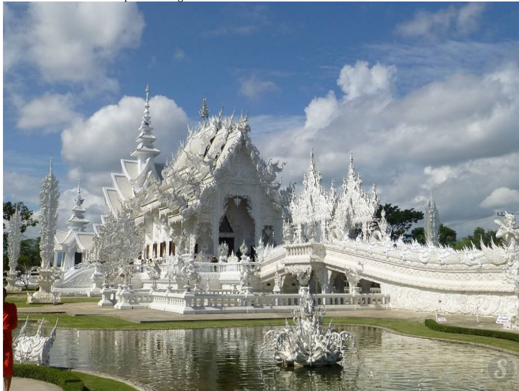
Wat Rong Khun is a place of worship entirely white south of Chiang Rai in Thailand.