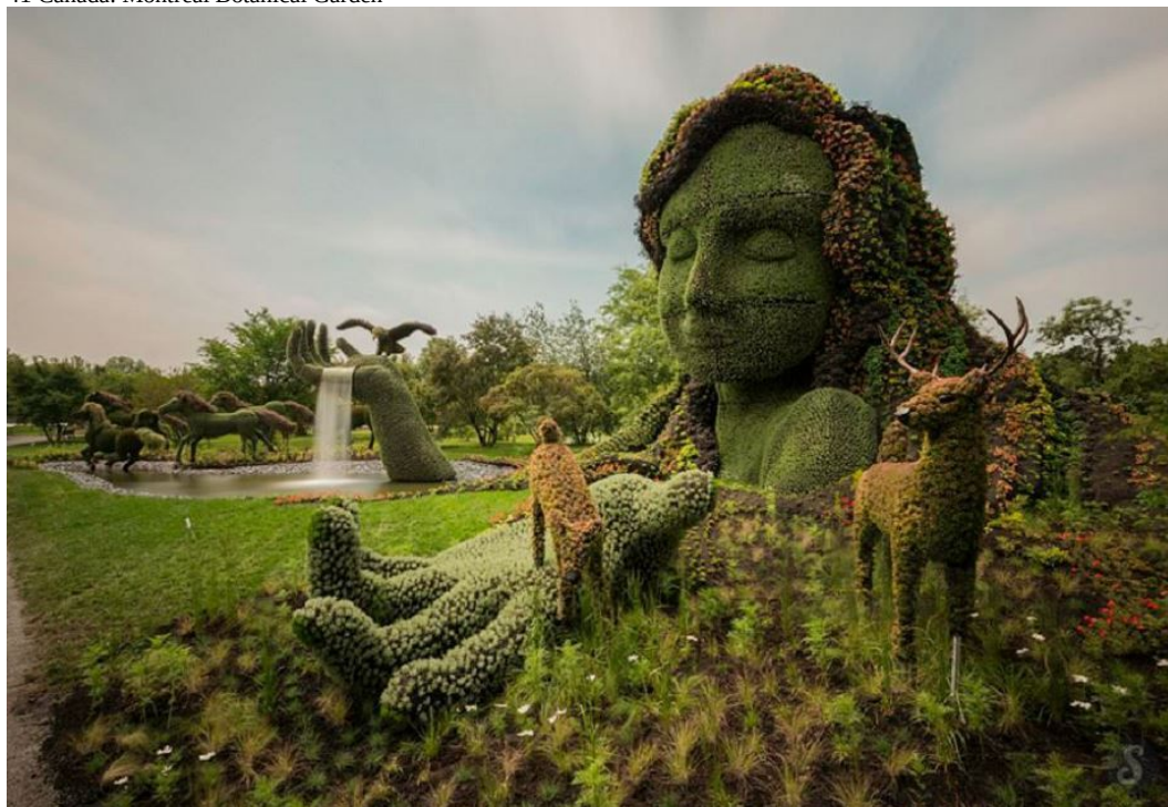
The Montreal Botanical Garden is located in Montreal, Quebec and is one of the largest botanical gardens in the world. It was created in June 1931.