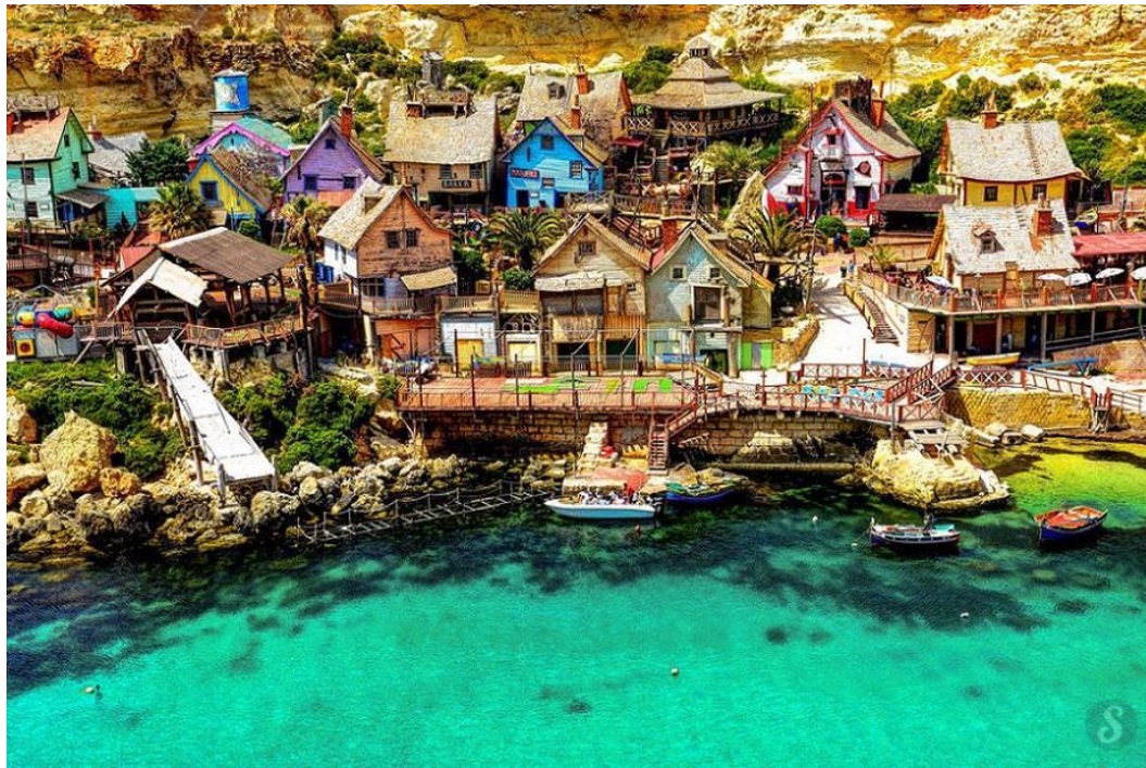
It was built as a movie set in 1980 for the film Popeye (Walt Disney). Today it is open to the public as a museum.