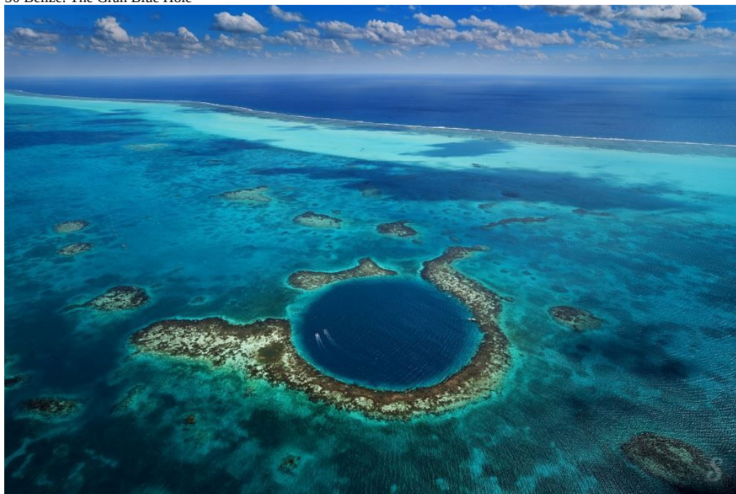
The Great Blue Hole is an underwater cenote off the coast of Belize. It is almost circular with a diameter of 300m and 120m deep.