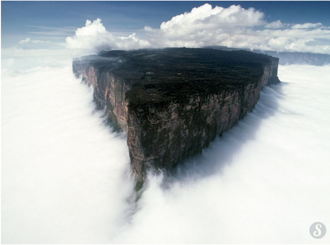
Mount Roraima is a South American mountain overlooking the clouds and rises to 2810 m