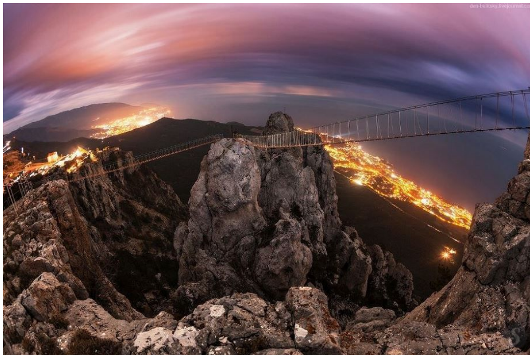
Ai-Petri is a mountain 1,230 meters high located in the region of Yalta in the Crimea.