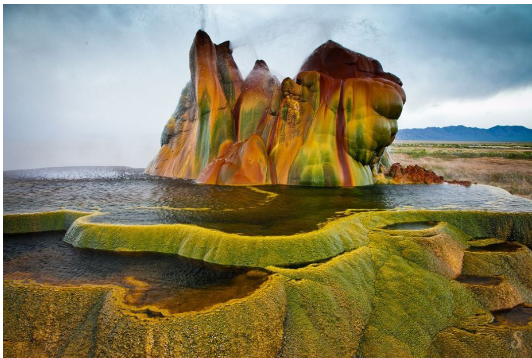
Fly Geyser is a small geyser in Washoe County, Nevada, which gives the impression of a brown ooze greenish color.