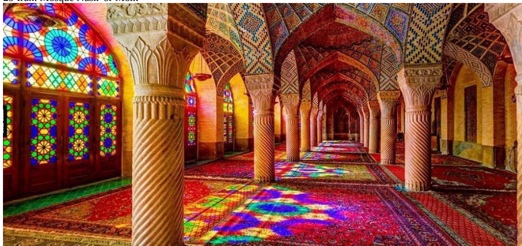
The Nasir-ol-Molk Mosque is a Shiite mosque in the province of Fars in Iran. It was built from 1876 to 1888 and is full of colors.