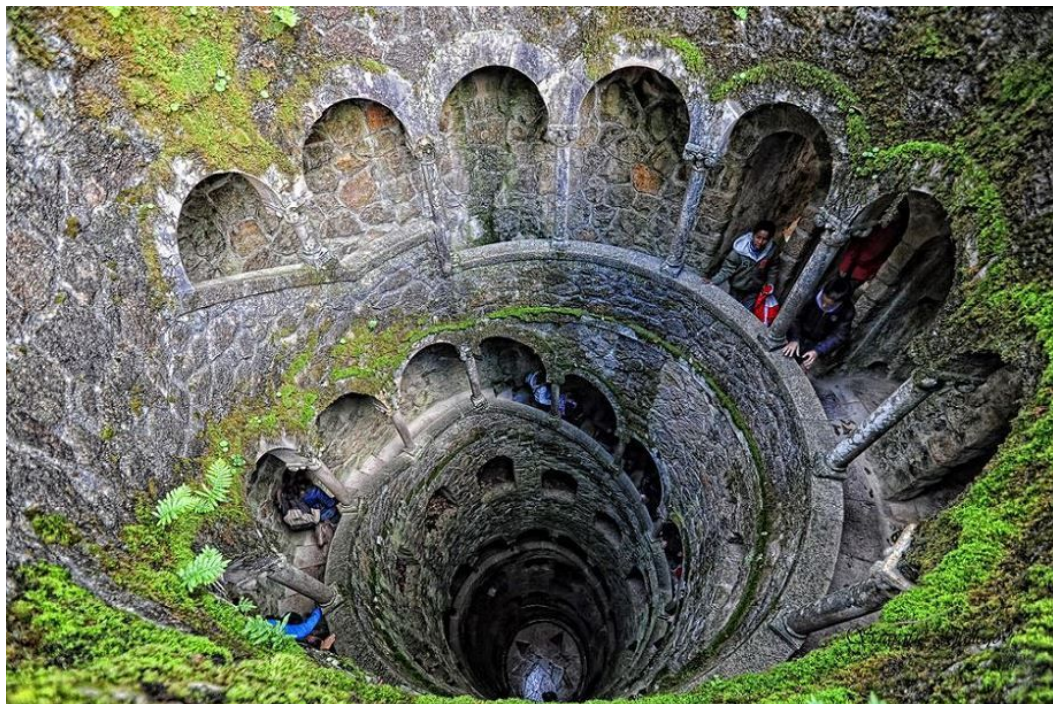
An interior view of the Palace of Regaleira located in Sintra, Portugal.