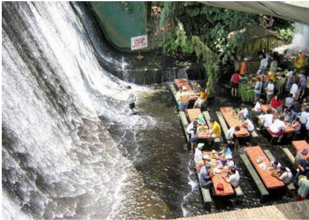
This restaurant in the Philippines offers its guests to eat their feet in the water. An artificial waterfall was built for the occasion.