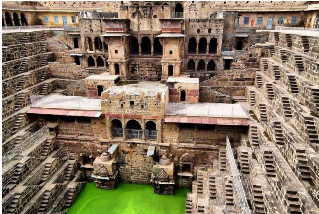
In Rajasthan, the building dating from the 11th century is one of the first baoris (wells) that has solved the problem of lack of water.