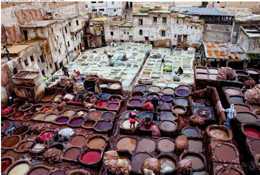
In the souk of Fez in Morocco is one of the oldest tanneries in the world.