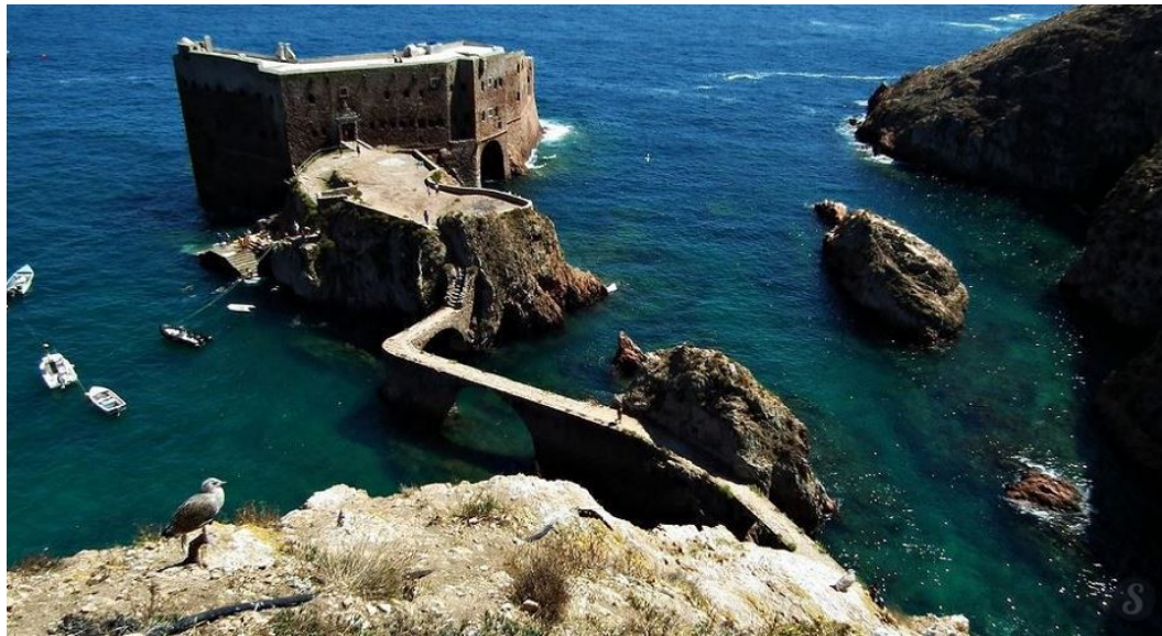
The Fort of São João Baptista is a seventeenth century fort located on the island of Berlengas in front of the port city of Peniche in central Portugal.