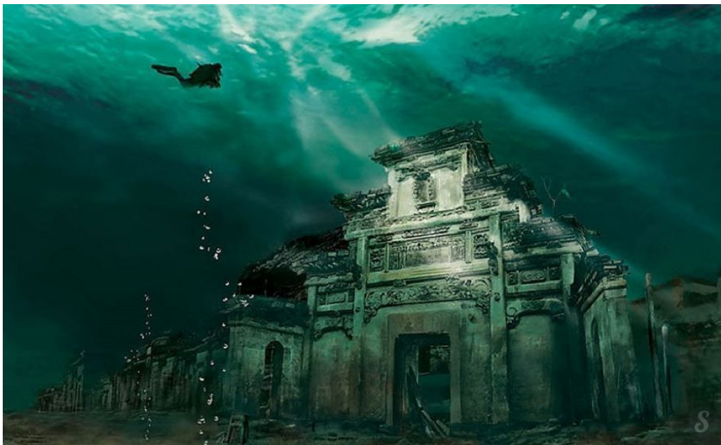
Qiandao Lake is based in the city of Shi Cheng, about 1300 years old, it is immersed for 53 years in the deep waters.