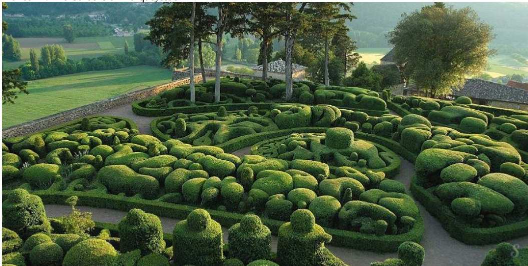
Marqueyssac gardens - Belvedere of the Dordogne are in the town of Vézac in a historic park of 22 hectares.