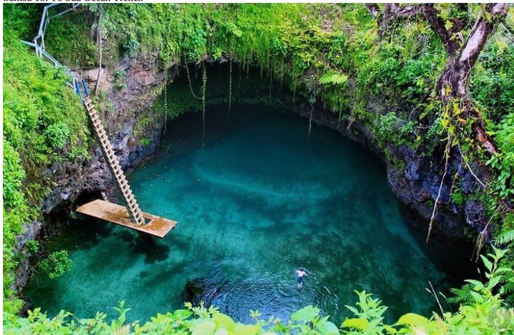
"To Sua Ocean" and a piece of paradise located in the village of Lotofaga in Samoa. The place is available to the public as bathing area.