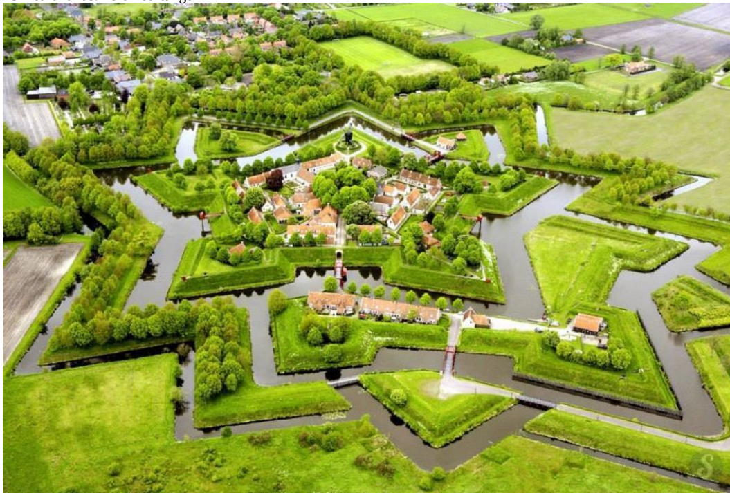
Bourtange is a Dutch fortified town in the province of Groningen, which was built in 1580.