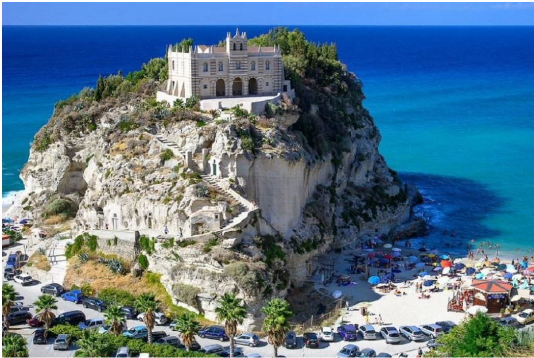
The Monastery of Santa Maria dell'Isola was built on a rocky cliff near the beach in Tropea, Italy.