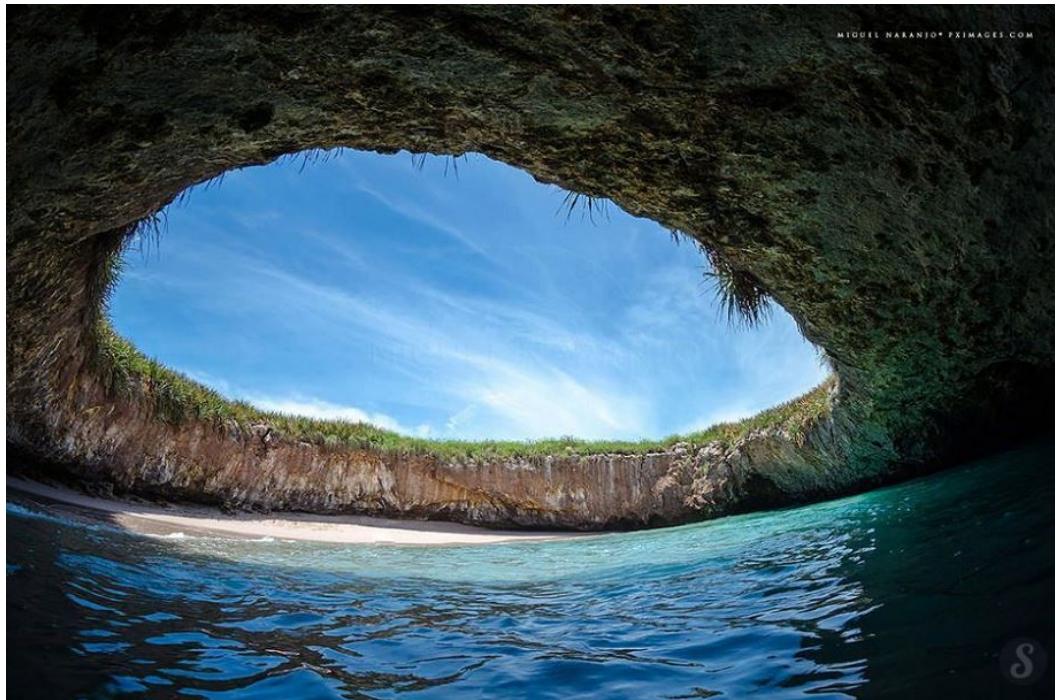
The Marieta Islands are an uninhabited archipelago off the coast of Nayarit, Mexico. It is an old military became protected national park area.