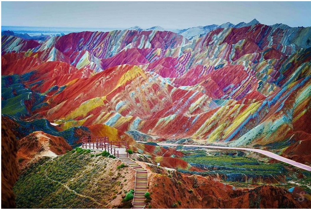
Zhangye Danxia mountains were formed on red terrigenous sedimentary layers that have been eroded for 24 million years.