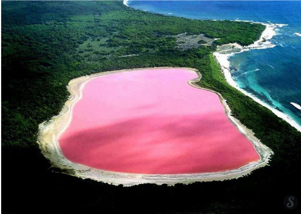
The Hillier lake on the island of Middle Island has a water pink, the cause remains unexplained. It was discovered in 1802 by a British explorer.