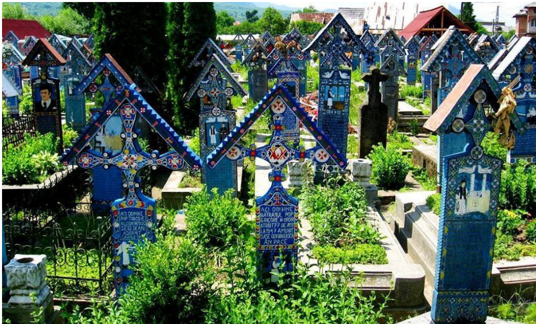
The Happy Cemetery of Sapan has an area that has Marmat wooden tombs, painted in bright colors.