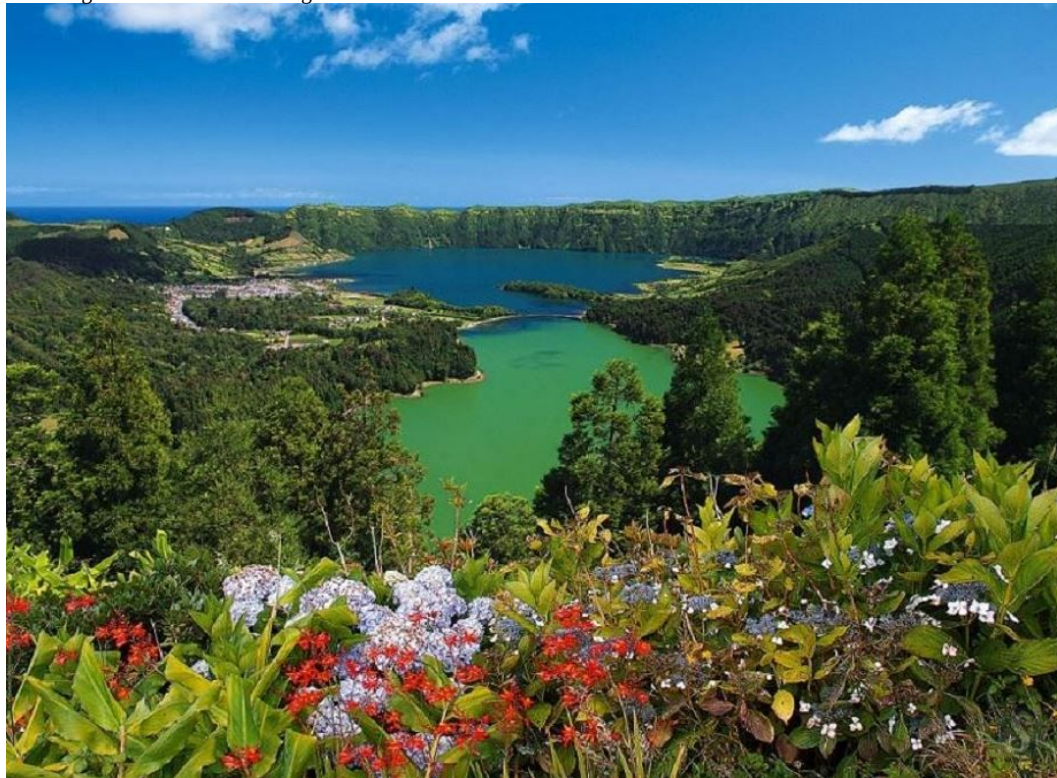
São Miguel is the largest island in the Azores archipelago and the most populated. It covers 464.6 square kilometers.