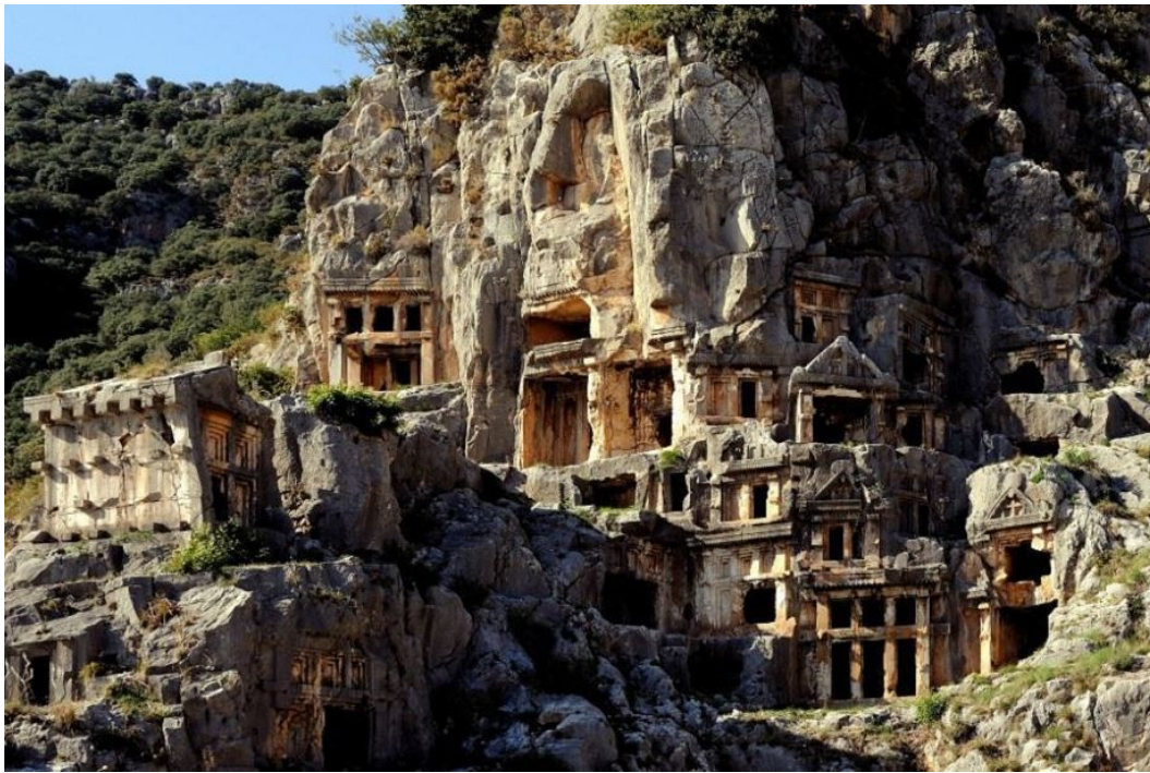
In Lycènes rocks are the rock tombs of the ancient city of Myra.