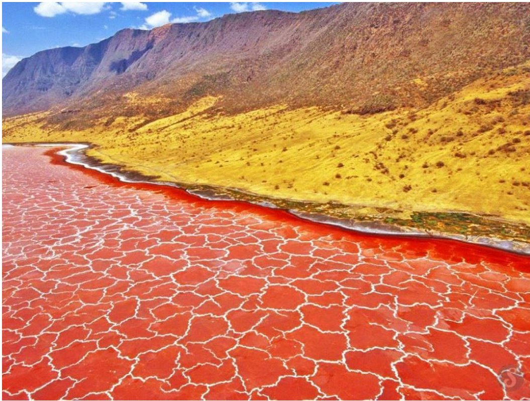
Lake Natron is an alkaline salt lake of tectonic origin endoreic present in northern Tanzania.