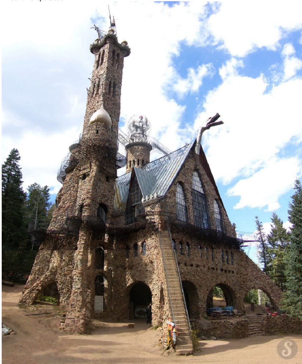
In the San Isabel Forest in Colorado is a medieval castle built over 40 years by Jim Bishop. He began building at the age of 15 years.