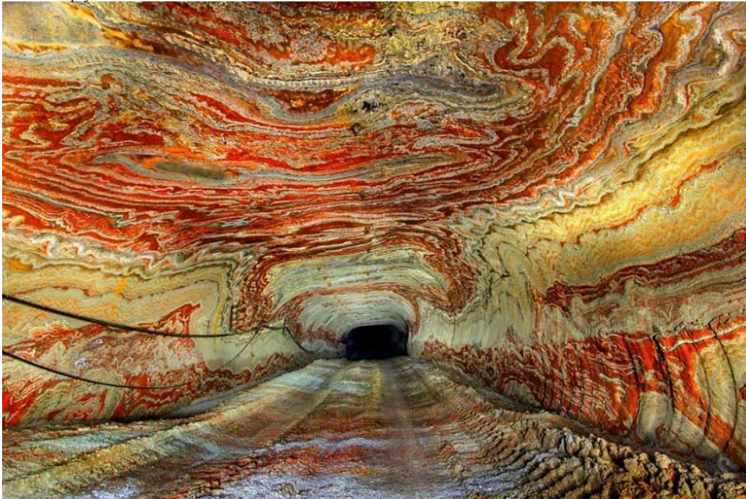
At the heart of the abandoned salt mine in Yekaterinburg in Russia. There is a wealth of Carnallite disused for several years.