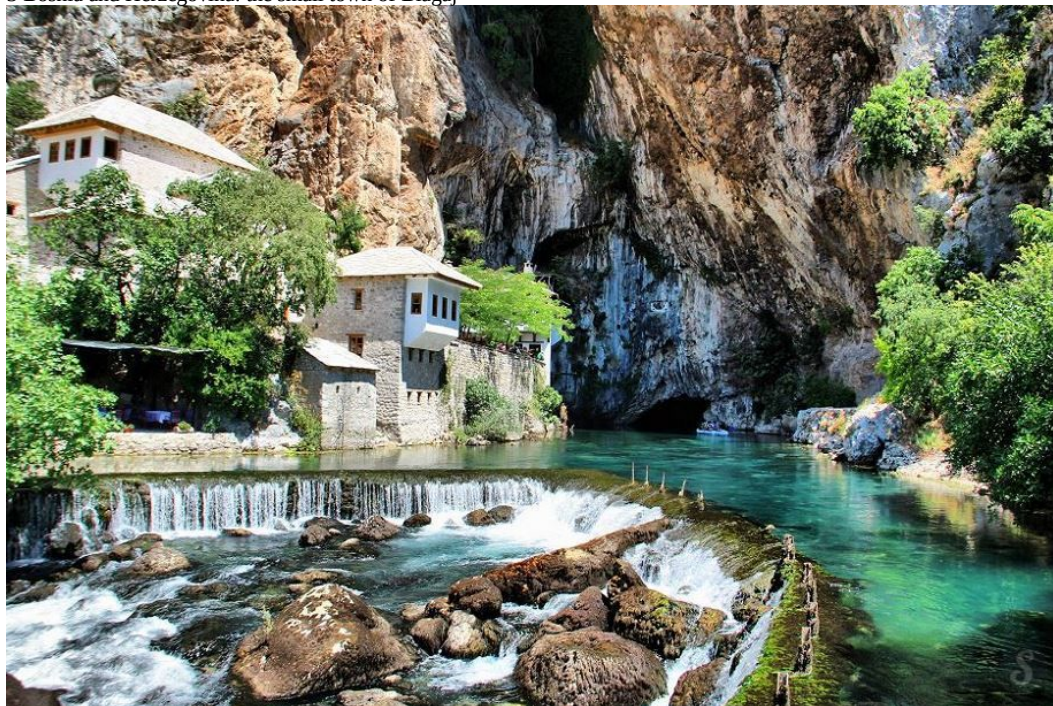
The Tekija house built in the 16th century next to the source of the Buna.