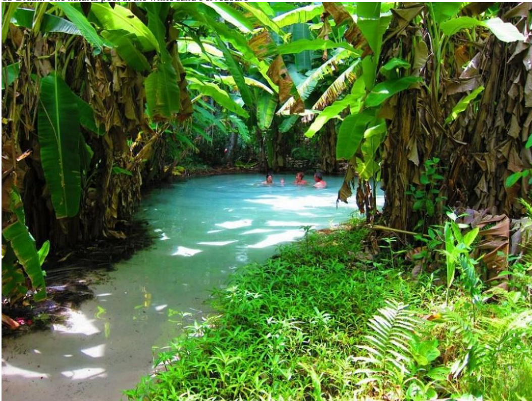
Near the village Mateiros is a natural pool, Fervedouro. It measures 8 feet in diameter, the water is crystal blue and the ground is white sand.