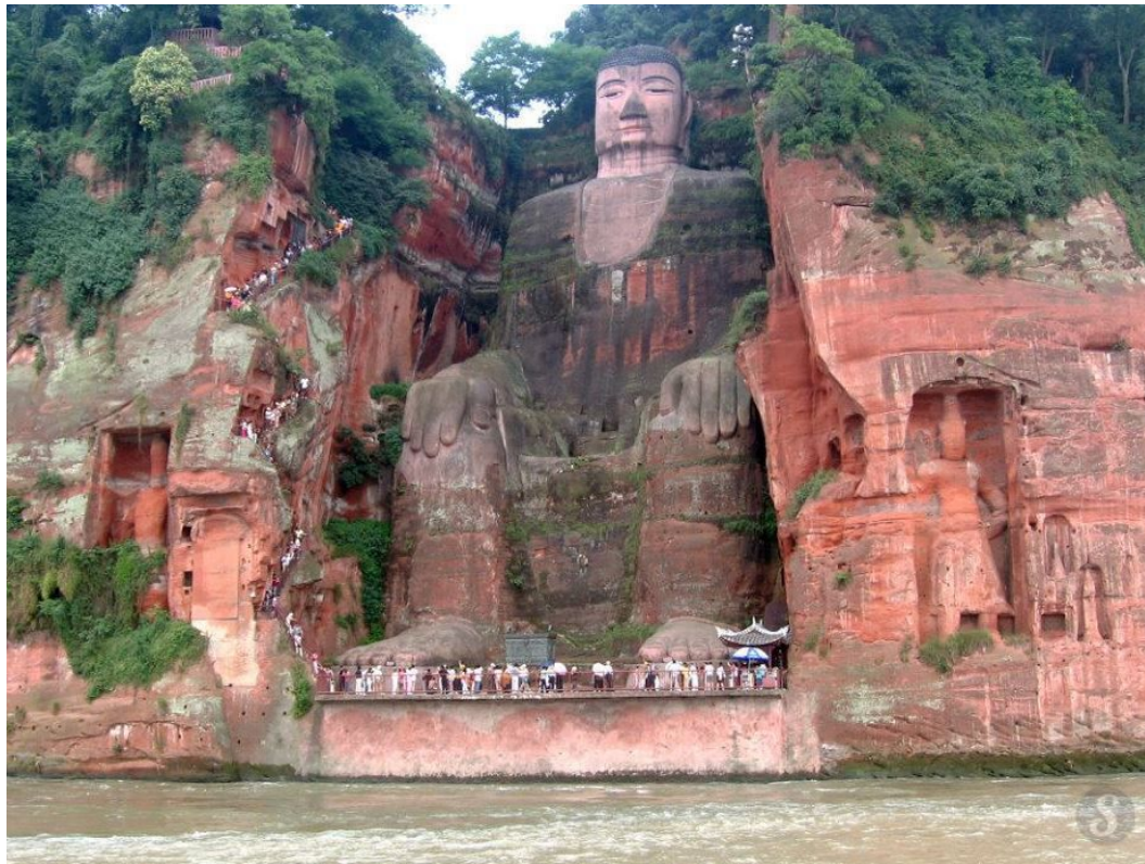
The Leshan Giant Buddha is a monumental statue of Buddha carved into the cliffs of Mount Lingyun Sichuan.