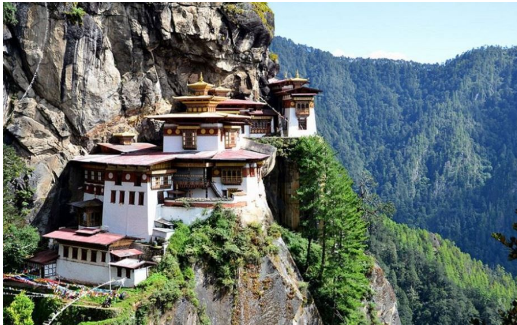
Taktsang is a Buddhist monastery in Bhutan, perched on a cliff at 3,120 meters above sea level.