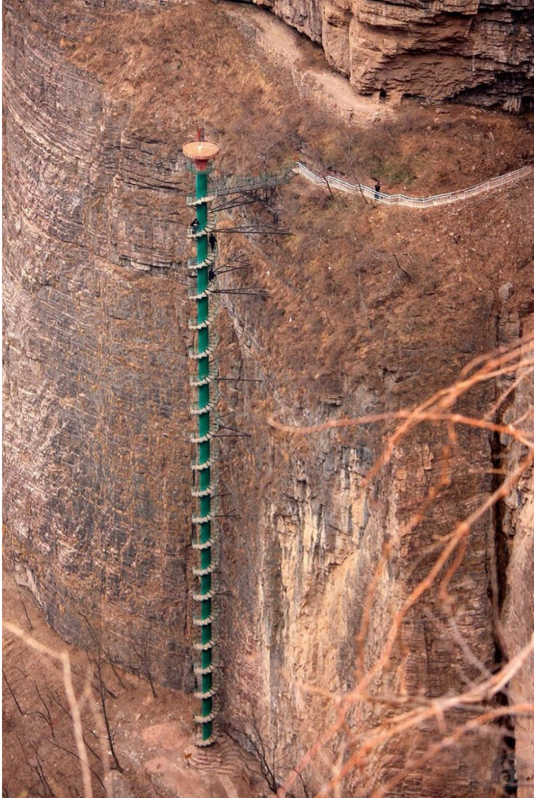
The spiral staircase on the Taihang Mountains is 91 meters high.