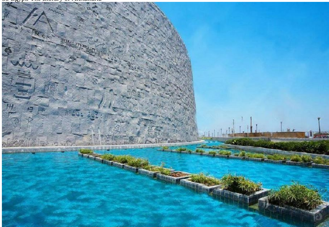
The Library of Alexandria was built in 1995 and cost $ 220 million. It was inaugurated in October 2002.