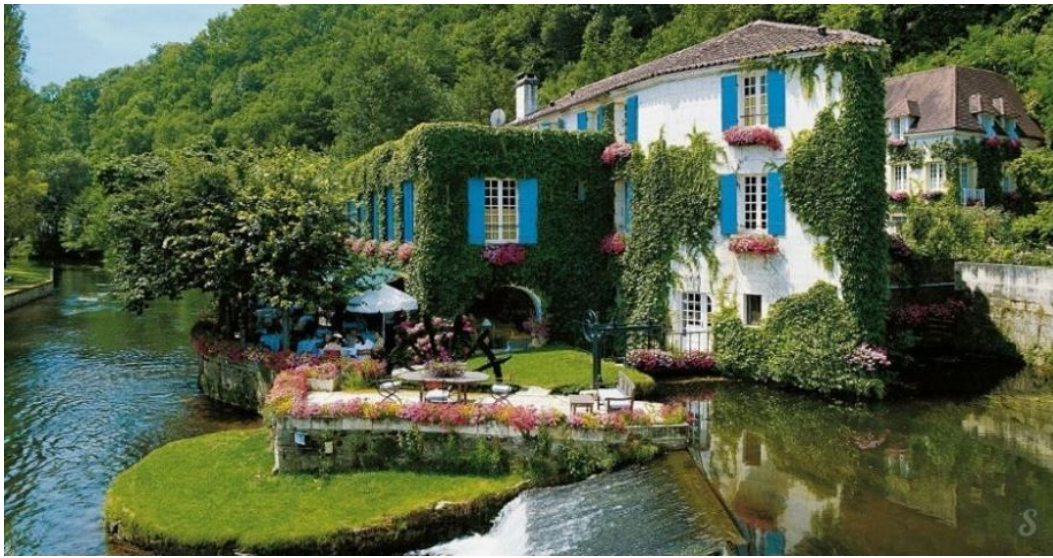
Le Moulin de l'Abbaye is a luxury hotel located in Brantôme-en-Perigord in the Dordogne. It is a luxury of the Perigord.