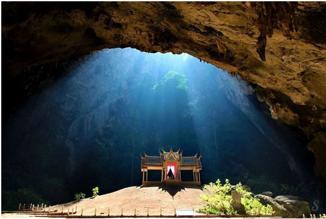
A Buddhist temple built in the middle of the cave Phraya Nakhon Thailand is illuminated by the light of heaven.