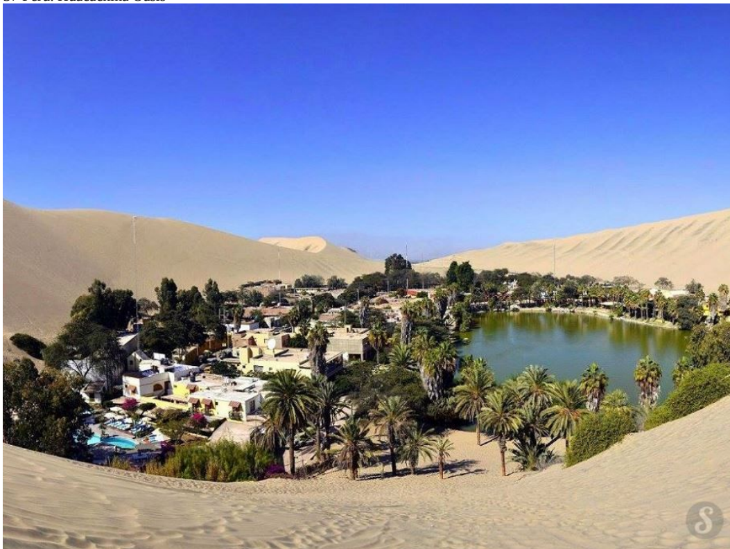
Huacachina is a village in the Ica Region, in southwestern Peru has an oasis. In 1999, only 115 people lived there.