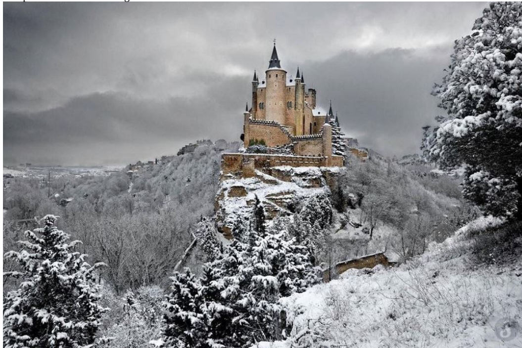
The Alcazar of Segovia is a fortified castle, located at the end of the old city of Segovia in Spain.