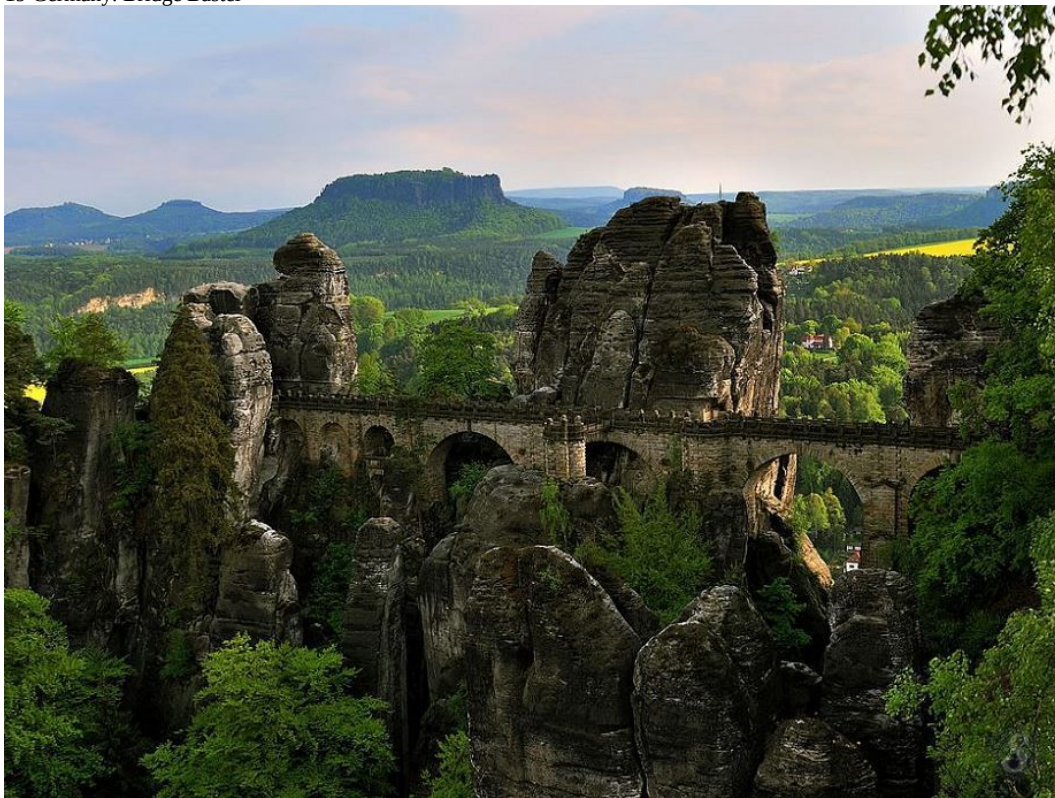
Bastei The bridge is located in the mountains of the Elbe in Saxon Switzerland in Germany.