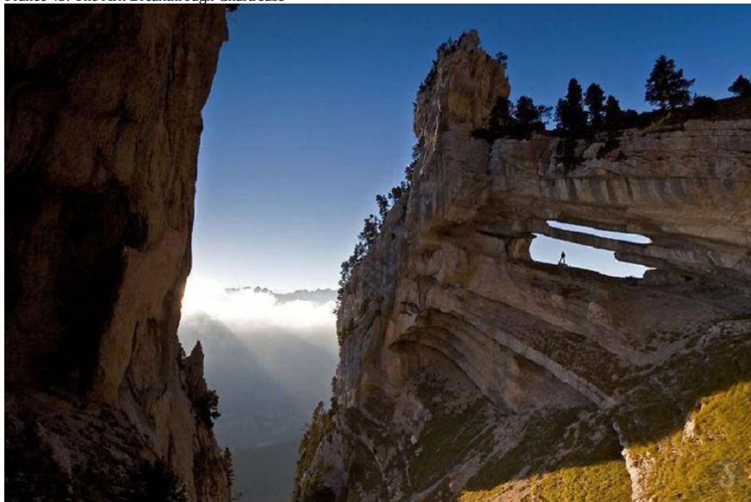
Discovered only in 2005, the double arch of the Breakthrough Tour is located in the Alps.