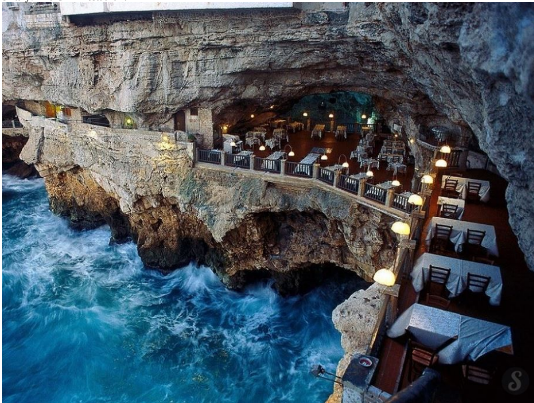
The Cliff Restaurant (Grotta Palazzese) was built in a cave in the region of Apulia in Italy.